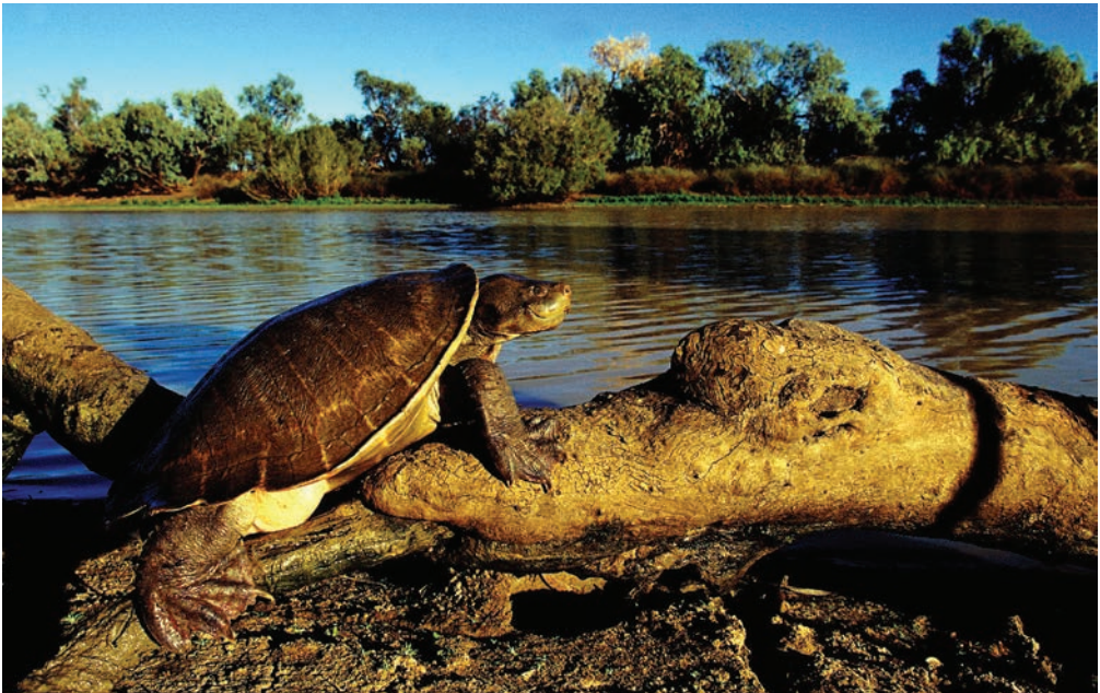
Fig. 5.1. The endemic Cooper Creek turtle is a giant of freshwater turtles and a top predator living mainly in the large waterholes of the Cooper Creek catchment.

Freshwater turtles in Australia are not only faced with a scarcity of water, compared to turtles in North America and Asia, but also the variability of when this water is available, given the considerable unpredictability in rainfall and resultant timing and magnitude of river flow and floodplain inundation. Turtles such as the Cooper Creek turtle ( Emydura macquarii emmottii ; Fig. 5.1), which survives in the driest part of our continent, cope in different ways with periodic drying and unpredictability, timing and duration of floods and dry periods.