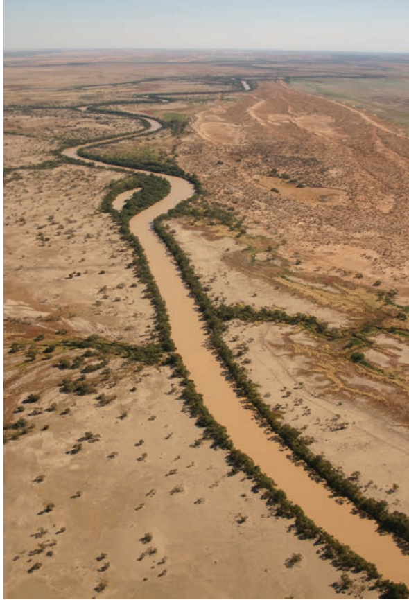
Fig. 5.3. Waterholes along Cooper Creek are deep and critically important aquatic habitat for turtles, which need to survive through prolonged dry periods. They form along the main channel during dry times. These waterholes are vulnerable to reductions in flows resulting from future water resource development (photo, R. T. Kingsford).

Waterloo billabong on Noonbah Station). They were observed walking just in front of a flood on the floodplain of South Galway Station, near Windorah, far from the nearest permanent waterhole (Sandy Kidd, pers. comm.). The turtles probably know the landscape well, and use the floods to move between waterholes and floodplains where there is plentiful food. The food source then concentrates as the boom period ends and floodplains dry out and fish, crustaceans and insects concentrate in the waterholes where the only water remains. Cooper Creek turtles are giants of the turtle world in Australia (Fig. 5.1).