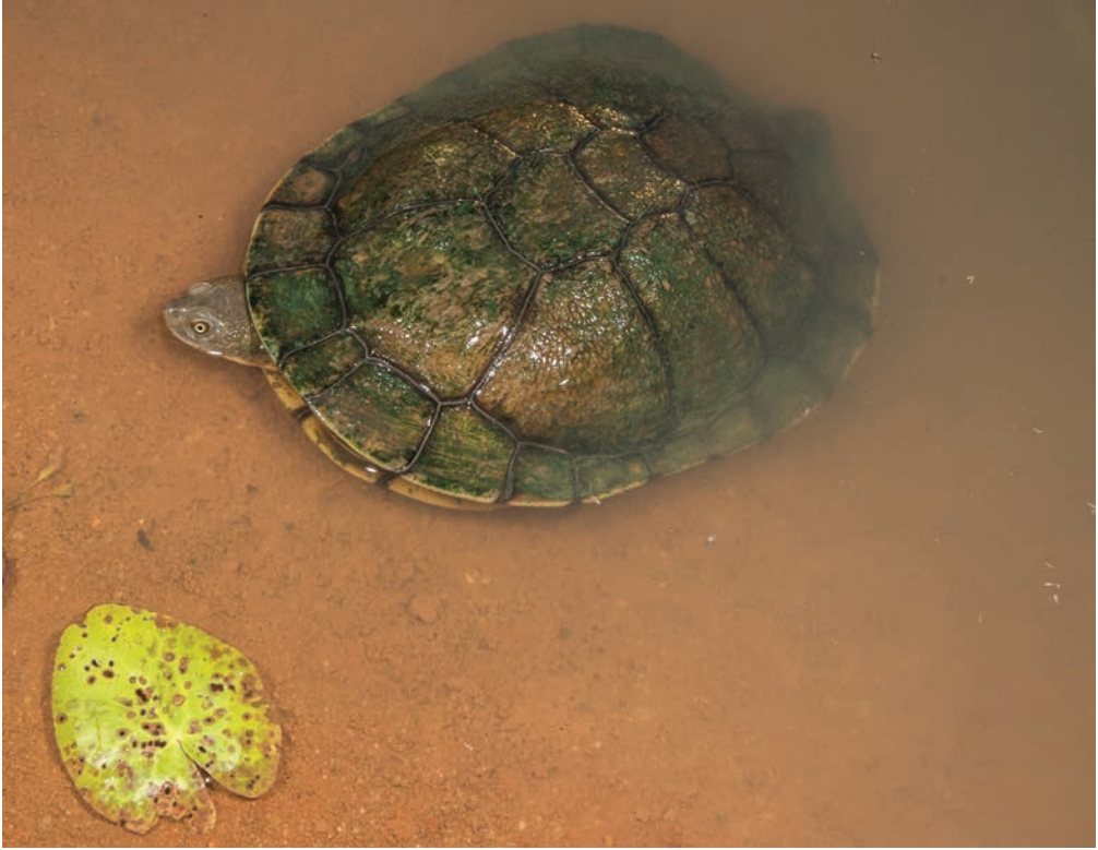
Fig. 5.2. Eastern long-necked turtles live in the upper reaches of the Lake Eyre Basin, favouring temporary waters and taking advantage of the production boom in invertebrate life when they fill.

Eastern long-necked turtles live in the Cooper catchment, but only as far south as Lake Dunn, near the town of Aramac. Further south along the Cooper becomes problematic for this species because of the long dry periods between flooding and the distances between waterholes which make overland migration difficult.