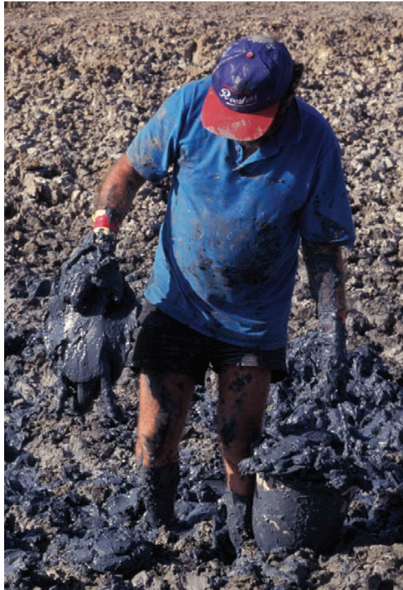
Fig. 5.4. During bust periods, turtles in Cooper Creek can die when waterholes dry up. Some individuals can survive briefly by seeking refuge in the mud, such as this Cooper Creek turtle from Lake Dunn, but they soon die.

The pressures of booms and busts and these life history tactics mean that populations of Cooper Creek turtles vary in a fascinating way, along the waterholes of Cooper Creek. Juveniles and adult males and females can be distinguished (Georges et al. 2006). The