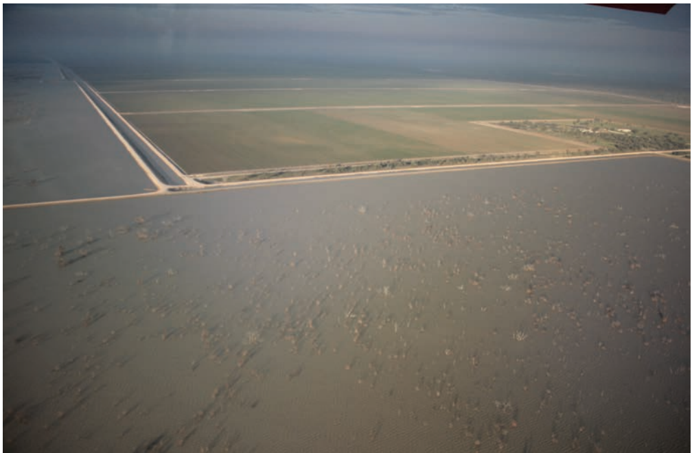
Fig. 14.2. Cubbie Station lies upstream of the Lower Balonne floodplain and has storage capacity to hold more than 500 000 ML of river water in large off-river storages, predominantly to irrigate cotton. This has decreased flooding downstream, incurring significant impacts on downstream communities.

Federal and state politicians from both major parties and their agencies jumped on the bandwagon, supporting this wealth creation and apparent economic success story. They brushed aside the complaints of downstream floodplain graziers or states and ignored caution about long-term impacts. Downstream communities in New South Wales were bitterly opposed, pointing out the inevitable consequences that were all too apparent on other river systems in the Murray–Darling Basin (Kingsford 2000b; see Chapter 16). The communities of Hebel and Dirranbandi also divided along these lines. Before long, the damage was all too apparent. The reliable low and medium floods disappeared, sucked into large storages (Fig. 14.2), and the rivers seldom broke their banks to flood. There was no longer enough