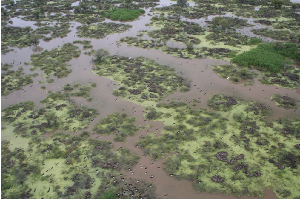
Fig. 14.3. Floodplains of the Narran Lake system, an internationally listed Ramsar site, like all floodplains on the Lower Balonne, rely on river flows from upstream, triggering widespread flooding and breeding of colonial waterbirds. Diversions of flows upstream to irrigation development have reduced the frequency of breeding events and degraded floodplain health (photo, R. T. Kingsford).

water to reach the end of the Lower Balonne system, except in extremely large floods. The social and economic impacts were real and harmful, even affecting the reliability of essential river flows for livestock and homesteads (stock and domestic flows). Downstream graziers and communities at Goodooga and Weilmoringle were particularly stressed (Fig. 14.1).