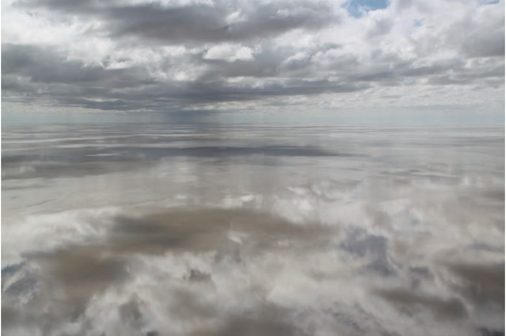
Fig. 1.2. Kati Thanda-Lake Eyre receives water regularly but very seldom fills enough to provide large productive areas for fish and waterbirds.