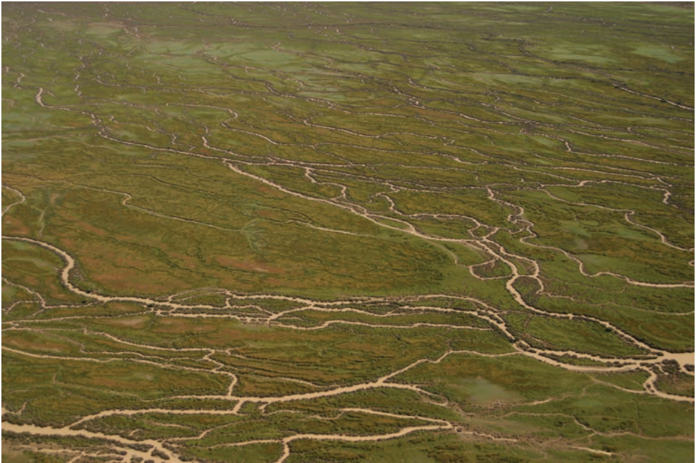
Fig. 1.5. The Georgina River catchment, including Eyre Creek, creates vast areas of Channel Country where water spreads out across the floodplain through a network of small channels (photo, R. T. Kingsford).

sequential floods occur (Kingsford et al. 2014). Floods which cover most of the lake return about every eight years (Kotwicki and Isdale 1991). Small floods or ‘in between’ flows are also critical to ensuring that waterholes are replenished and retain water through long dry periods (Bunn et al. 2006a). Variation in flows and flooding occurs up and down the rivers, varying in time and area. No two floods are the same. Minor changes in the rivers can alter where the water goes. Boom and bust cycles drive much of the ecology of the rivers and wetlands, producing tremendous responses in biological productivity during floods, which then ‘shut down’ during the bust periods.