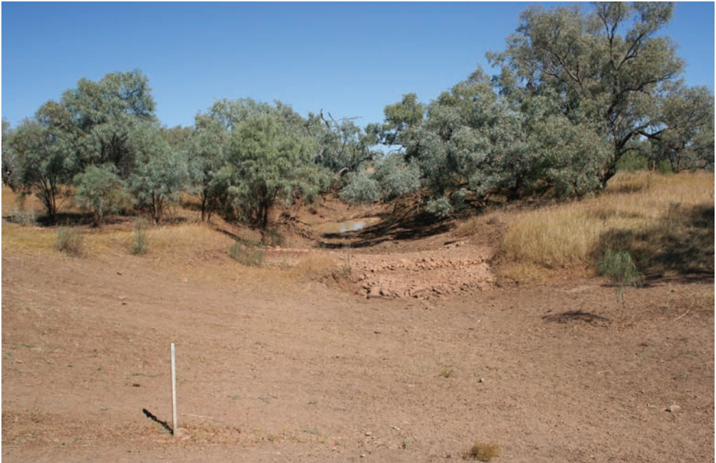
Fig. 1.7. Chinese ‘gardeners’ were among the first developers of the rivers of the Lake Eyre Basin, creating weirs, such as this one on the Diamantina waterholes, which controlled water that could then be diverted to irrigate vegetables.

Development of the rivers of the Lake Eyre Basin could easily have followed a similar path, when the Currareva development proposal on Cooper Creek was put forward in 1995 (see Chapter 17). This was essentially an irrigation development similar in size and volume to those already established in the more easterly Murray–Darling Basin rivers, with the potential to harvest and store water from small, medium and large floods in off-river storages. There is no more notorious example of the ecological and social impacts of such development than that on the Condamine–Balonne River system, the last major river to be developed in the Murray–Darling Basin (Kingsford 2000b), where small-scale irrigation developments were ratcheted up under increasing pressure from the irrigation industry, often abetted by different Queensland Government agencies (see Chapter 21). This has had considerable impacts on socio-economic values downstream (see Chapter 15).