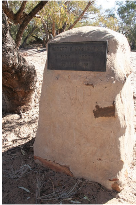
Fig. 1.4. Memorial to Robert O'Hara Burke, who died on Cooper Creek on 28 June 1861. He was the leader of the ill-fated Burke and Wills expedition to northern Australia.

roast it to remove the damaging enzyme 'thiaminase', which contributed to their demise. Misreading these landscapes, Charles Sturt, a successful explorer of the continent's Murray–Darling Basin rivers, underestimated the size and importance of Cooper Creek, naming it a creek in 1845, presumably unconvinced that it was sufficiently large to be called a river. Two rivers (the Barcoo and the Thomson) flow into the Cooper, which can flood across up to 80 km of floodplain – clearly a substantial river.