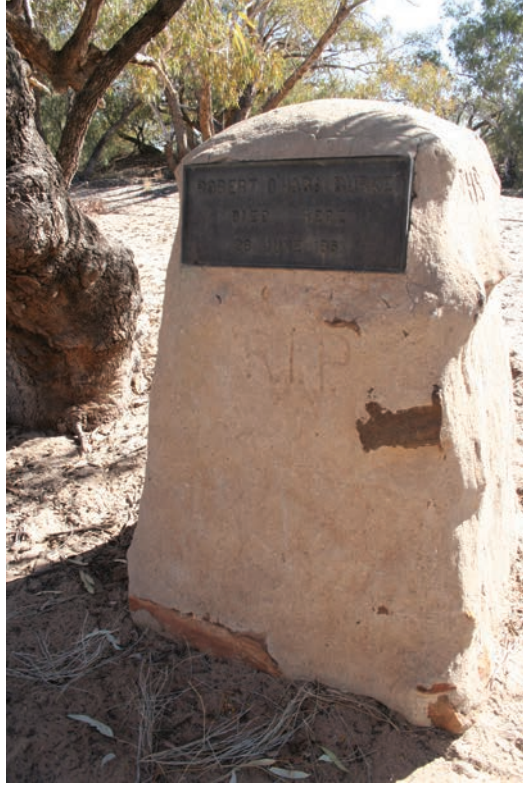
Fig. 1.4. Memorial to Robert O'Hara Burke, who died on Cooper Creek on 28 June 1861. He was the leader of the ill-fated Burke and Wills expedition to northern Australia.

roast it to remove the damaging enzyme 'thiaminase', which contributed to their demise. Misreading these landscapes, Charles Sturt, a successful explorer of the continent's Murray–Darling Basin rivers, underestimated the size and importance of Cooper Creek, naming it a creek in 1845, presumably unconvinced that it was sufficiently large to be called a river. Two rivers (the Barcoo and the Thomson) flow into the Cooper, which can flood across up to 80 km of floodplain – clearly a substantial river.