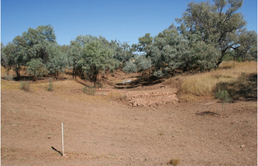
Fig. 1.7. Chinese ‘gardeners’ were among the first developers of the rivers of the Lake Eyre Basin, creating weirs, such as this one on the Diamantina waterholes, which controlled water that could then be diverted to irrigate vegetables (photo, R. T. Kingsford).

Development of the rivers of the Lake Eyre Basin could easily have followed a similar path, when the Currareva development proposal on Cooper Creek was put forward in 1995 (see Chapter 17). This was essentially an irrigation development similar in size and volume to those already established in the more easterly Murray–Darling Basin rivers, with the potential to harvest and store water from small, medium and large floods in off-river storages. There is no more notorious example of the ecological and social impacts of such development than that on the Condamine–Balonne River system, the last major river to be developed in the Murray–Darling Basin (Kingsford 2000b), where small-scale irrigation developments were ratcheted up under increasing pressure from the irrigation industry, often abetted by different Queensland Government agencies (see Chapter 21). This has had considerable impacts on socio-economic values downstream (see Chapter 15).