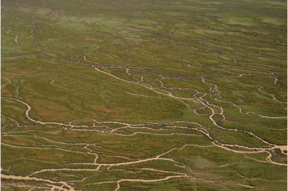
Fig. 1.5. The Georgina River catchment, including Eyre Creek, creates vast areas of Channel Country where water spreads out across the floodplain through a network of small channels.

sequential floods occur (Kingsford et al. 2014). Floods which cover most of the lake return about every eight years (Kotwicki and Isdale 1991). Small floods or ‘in between’ flows are also critical to ensuring that waterholes are replenished and retain water through long dry periods (Bunn et al. 2006a). Variation in flows and flooding occurs up and down the rivers, varying in time and area. No two floods are the same. Minor changes in the rivers can alter where the water goes. Boom and bust cycles drive much of the ecology of the rivers and wetlands, producing tremendous responses in biological productivity during floods, which then ‘shut down’ during the bust periods.