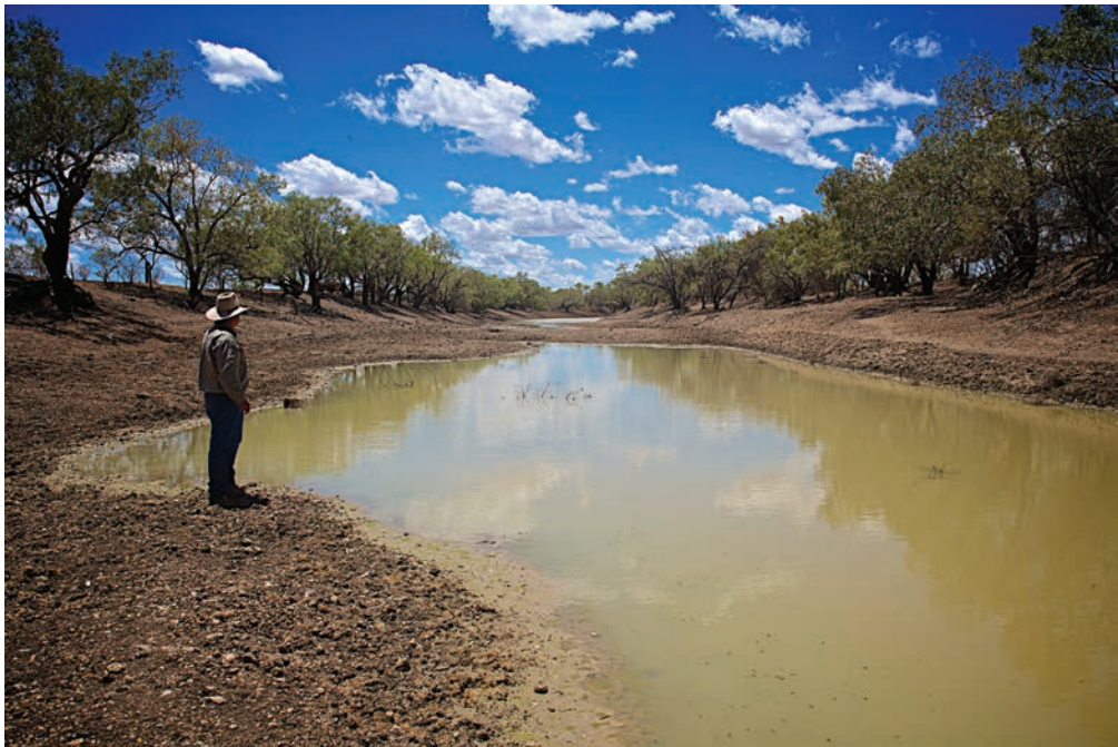
Fig. 1.6. Dry periods leave only the waterholes with water where fish, turtles and some waterbirds congregate, waiting for the next flood.

Once the waterholes are full, water spreads across the adjacent floodplain through a network of ephemeral channels. The floodplains are extensive in some places (40–80 km wide; Kingsford et al. 2014). This is the Channel Country, where myriads of channels intertwine to take water out over the vast floodplains. The larger floodplains of Lake Eyre