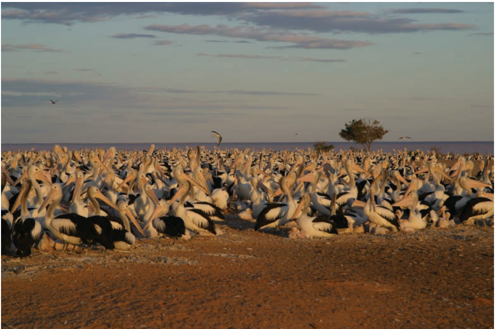
Fig. 1.3. Australian pelicans form large breeding colonies on some of the large lakes of the Lake Eyre Basin where there are islands, such as Lake Machattie.