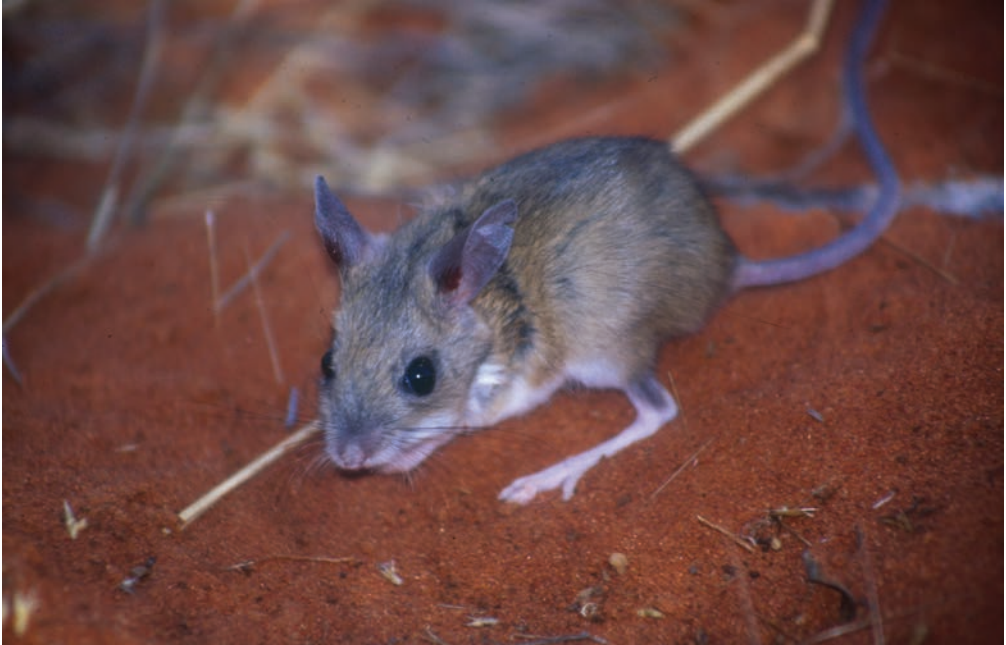
Fig. 6.2. Small mammals such as this spinifex hopping-mouse ( Notomys alexis ) live in the sand dune habitats of the Simpson Desert, feeding on seeds, and go through boom and bust phases that coincide with productive rainfall and dry periods, respectively.