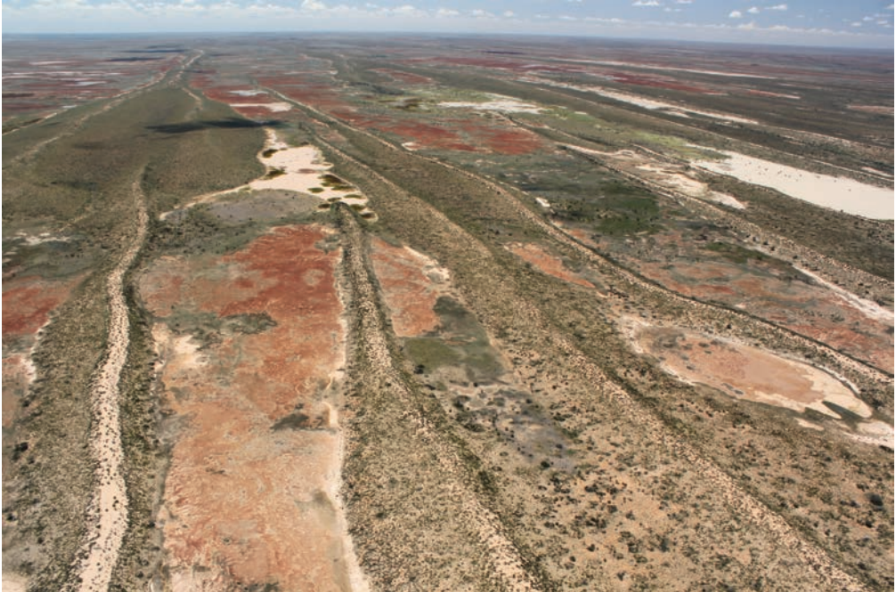
Fig. 6.1. These dunes and channels across the Simpson Desert are part of the desert channels environment, including the Channel Country of Cooper Creek and Georgina–Diamantina Rivers, Mitchell grass downs, desert uplands and Simpson–Strzelecki dunefields. This vast area is biologically highly productive, driven by boom and bust cycles of rainfall and flooding, and it provides habitats for many terrestrial mammals.