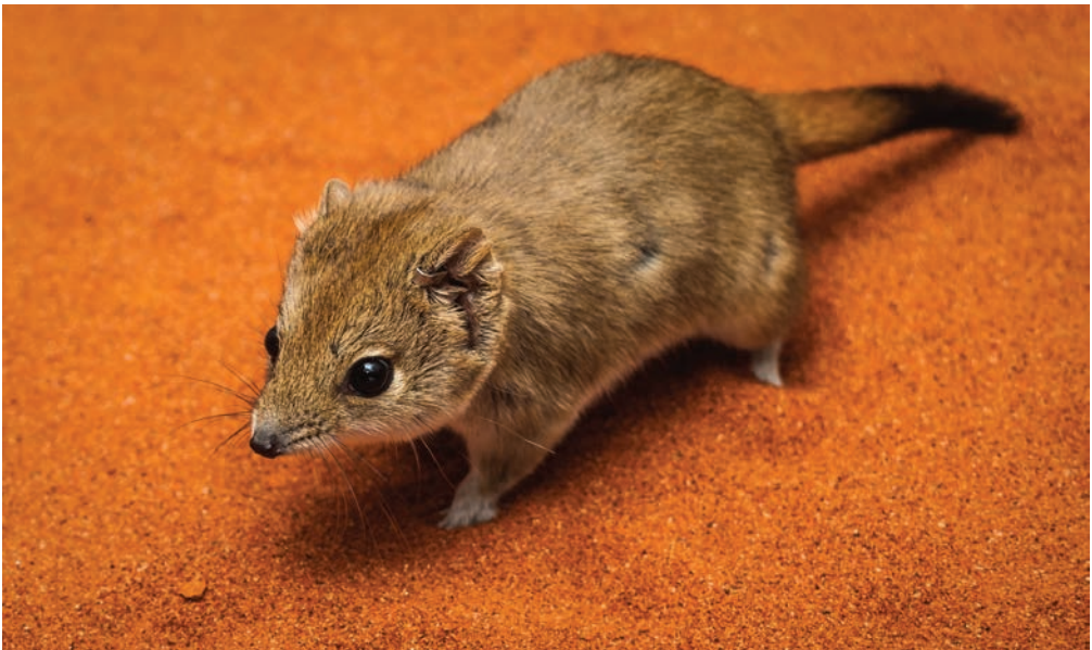
Fig. 6.3. Brush-tailed mulgaras ( Dasyercus blythi ) are predators, feeding on invertebrates, rodents and other small vertebrates, living in the sand dune habitats of the Simpson Desert. Similar to native rodents, mulgara populations go through boom and bust phases that coincide with productive rainfall and dry periods, respectively.