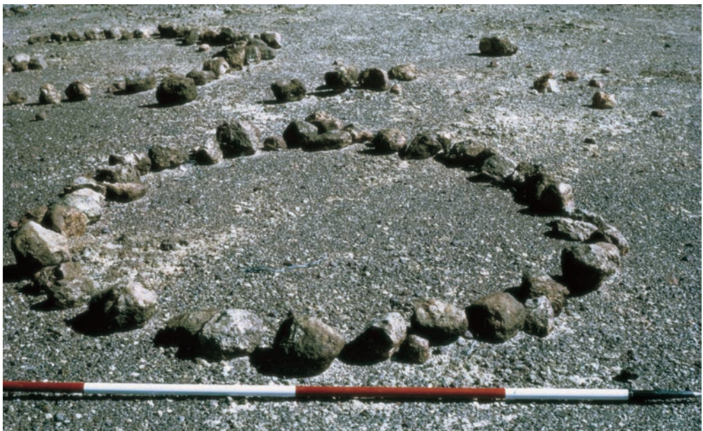
Fig. 7.1. Aboriginal people were living on the Lake Eyre Basin rivers up to 50 000 years ago, with evidence of their ongoing connection to country clear everywhere, including these stone arrangements near Blackall in the Barcoo River catchment.

The free-flowing rivers of the Lake Eyre Basin mark the Basin as one of Australia's more important cultural and natural systems. It has outstanding environmental, cultural and economic value, supported by rivers, lakes and floodplains that fluctuate between highly unpredictable boom and bust cycles. Floods bring spectacular biological productivity to the rivers and their floodplains. Vast areas are inundated, becoming a magnet to millions of waterbirds, fish, frogs and invertebrates (Kingsford et al. 1999; Capon 2007; see Chapters 3 and 4). The conditions trigger a prolific germination of plant life, providing primary productivity (Capon and Brock 2006) on which wildlife and livestock (Phelps et al. 2007) depend. People too have relied on these extreme and sporadic events to replenish water resources and, for Aboriginal people, they nourish a deep history of stories and life centred on these great rivers for tens of thousands of years (see Chapters 8 and 9; Fig. 7.1). The rivers