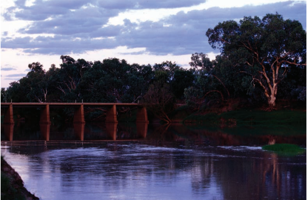
Fig. 7.3. Currareva Waterhole on Cooper Creek, the location of a large-scale irrigation development proposal in 1995, requiring changes to the Queensland water resource plan (photo, A. Emmott).

the river system. Similar scientific resolutions, underpinned by consistent community concern and conviction, followed in later conferences (see Chapter 17).