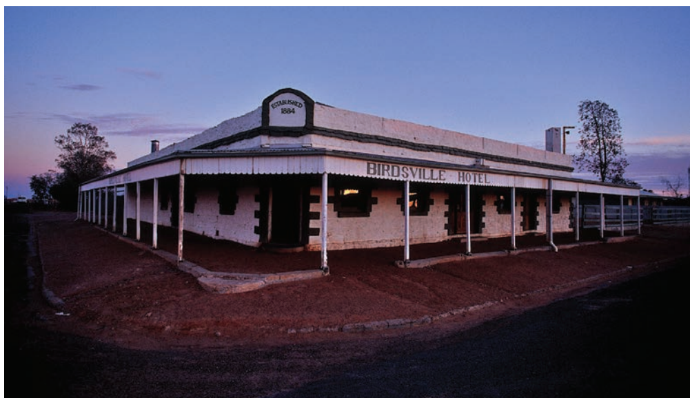
Fig. 7.4. Famous Birdsville Hotel in the outback town of Birdsville, the location for many key meetings including one in 1995, triggering the start of long and enduring partnerships among Aboriginal people, conservationists, industry, scientists, landholders and government officers.

The Birdsville meeting was a formal catalyst for collaboration around the sustainable use and management of water across the Lake Eyre Basin. And it succeeded: the Lake Eyre Basin