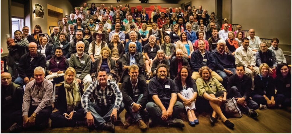
Fig. 7.6. Landholders, Traditional Owners, scientists, government officers and industry members at the 2013 Lake Eyre Basin Biennial Conference in Port Augusta.

Aboriginal Forum. The Scientific Advisory Panel (Fig. 7.2b) provides scientific expertise on ecology, hydrology and socio-economics. Member scientists are often actively doing research in the Basin. The natural resource management bodies are also closely connected to this process, with several members on the Community Advisory Committee (Fig. 7.2a,b).