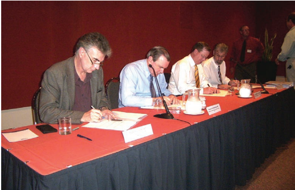
Fig. 7.5. Government ministers and members of the Lake Eyre Basin Coordinating Group at the signing of the Lake Eyre Basin Intergovernmental Agreement in 2004, when the Northern Territory signed.

rivers. This culminated in the signing of the Lake Eyre Basin Intergovernmental Agreement in 2000, focusing state, territory and federal governments on protecting its free-flowing rivers (Table 7.1). The Northern Territory subsequently signed the agreement in 2004 (Fig. 7.5). This framework provided the institutional governance for an already united community, and overarching arrangements to protect the Basin through partnerships with the community, industry, scientific and government people. The focus was on ‘water and related natural resources’, in particular the protection of natural variability in river flows, and, although not explicit, this also included flow volumes.