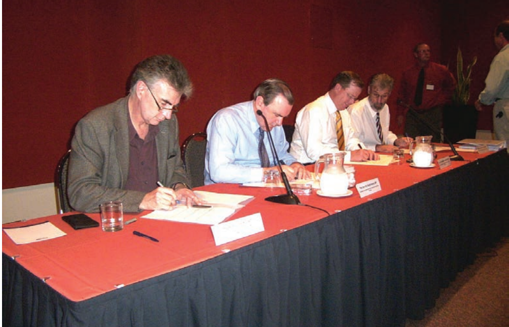
Fig. 7.5. Government ministers and members of the Lake Eyre Basin Coordinating Group at the signing of the Lake Eyre Basin Intergovernmental Agreement in 2004, when the Northern Territory signed (photo, V. Norris).

ivers. This culminated in the signing of the Lake Eyre Basin Intergovernmental Agreement in 2000, focusing state, territory and federal governments on protecting its free-flowing rivers (Table 7.1). The Northern Territory subsequently signed the agreement in 2004 (Fig. 7.5). This framework provided the institutional governance for an already united community, and overarching arrangements to protect the Basin through partnerships with the community, industry, scientific and government people. The focus was on ‘water and related natural resources’, in particular the protection of natural variability in river flows, and, although not explicit, this also included flow volumes.