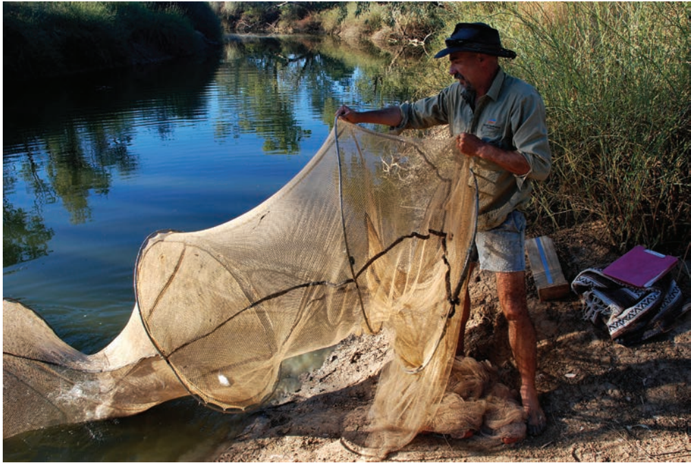
Fig. 4.2. Catching fish using fyke nets in a waterhole of the Mulligan River in the Georgina River catchment of the Lake Eyre Basin.