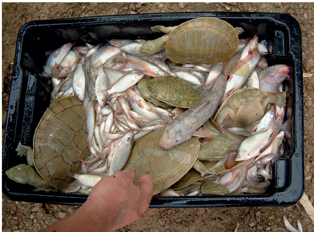
Fig. 4.3. In boom phases, the high productivity in waterholes and on floodplains provides opportunities for fish species – such as these spangled perch, Cooper Creek tandan, Lake Eyre golden perch, Barcoo grunter, silver tandan, Hyrtl’s tandan – to build up their populations. Fish catches were identified to species, counted, measured and weighed. Turtles and most fish were returned to the water alive.

Although their spawning strategies vary, most native species in Cooper Creek benefit from rising channel flows and floods by moving into backwater habitats, flooded channels and floodplains to feed and grow in shallow, food-rich, warm-water habitats (Balcombe et al. 2007). Fish use backwaters and flooded areas as larvae, juveniles and adults. All native species other than Australian smelt and Cooper Creek catfish have been caught on the floodplain as adults, and nine species have been collected in the juvenile life stage. Sampling in floodplain habitats has also yielded the late stage larvae of six native species (bony bream, yellowbelly, Hyrtl’s tandan, silver tandan, smelt and spangled perch). The Cooper Creek catfish may be the only native species to spend its entire life history within waterholes and channels. Juveniles and mature individuals of the alien mosquitofish have also been recorded from floodplains; however, goldfish captures have been confined to waterholes.